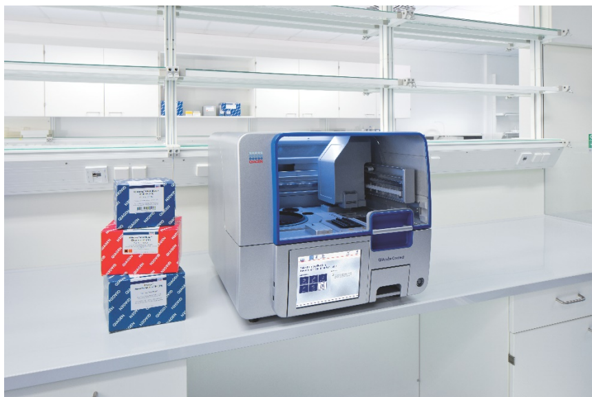
Figure 1. QIAcube Connect